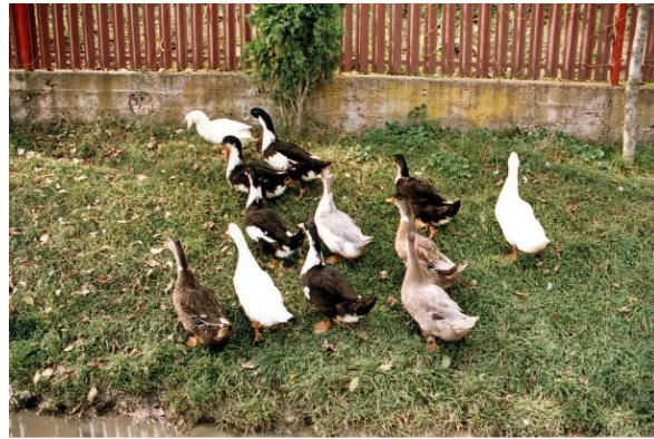
White Hungarian duck (Gödöllő, 2000); and colour variants of Hungarian duck (Mezőszilvás, Mezőség, 2005); Photo: Szalay István